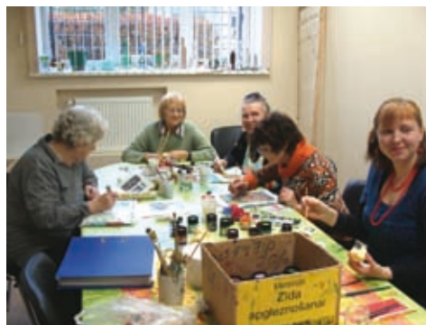
The theme of active aging and intergenerational solidarity is highlighted in activities oriented at public health, health promotion and social integration.

Since 2012 the Nordic walking classes have been available at seven day care centres for adults. Similarly, reinforced mental health promotion and dementia prevention support for the seniors are being provided in day care centres, providing the specialists with