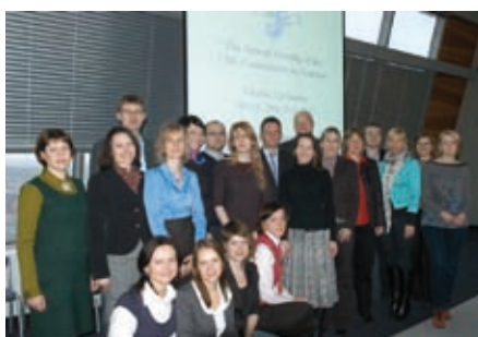
Twelve CoT members, guests and observers took part in the meeting

The second one - Enjoy South Baltic! – Joint actions promoting the South Baltic area as a tourist destination is a new and innovative cross-border project implemented by partners from Poland, Lithuania and Germany. The aim of the project is to strengthen the