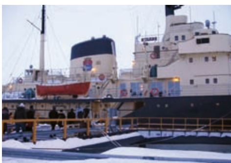
The participants had a chance to see the famous Snow Castle of Kemi and ice-breaker "Sampo".

During the meeting the participants had a chance to learn more about