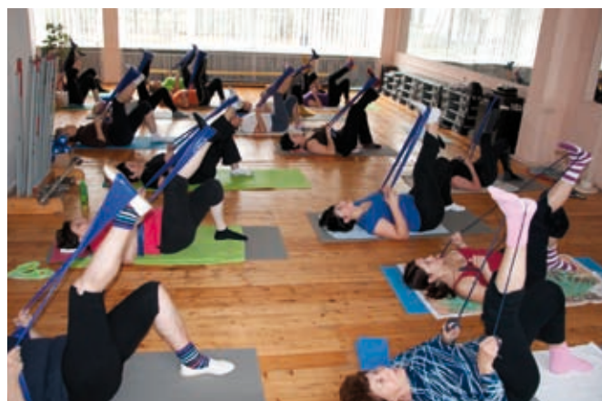
For promotion of a greater physical activity the program „Robust Health“ is carried out. It gives possibilities for elderly people to take free-of charge exercises at body-building gyms, swimming pools, to go in for yoga and dancing lessons. Annually, over 500 people participate in the program.

In the field of infectious diseases prevention, the Program of Drug Reduction has been under implementation since 1996 – it has determined that HIV/AIDS problem is controlled and not so outspread as in neighbouring countries. Klaipėda is also a member of European Cities against Drugs organization.