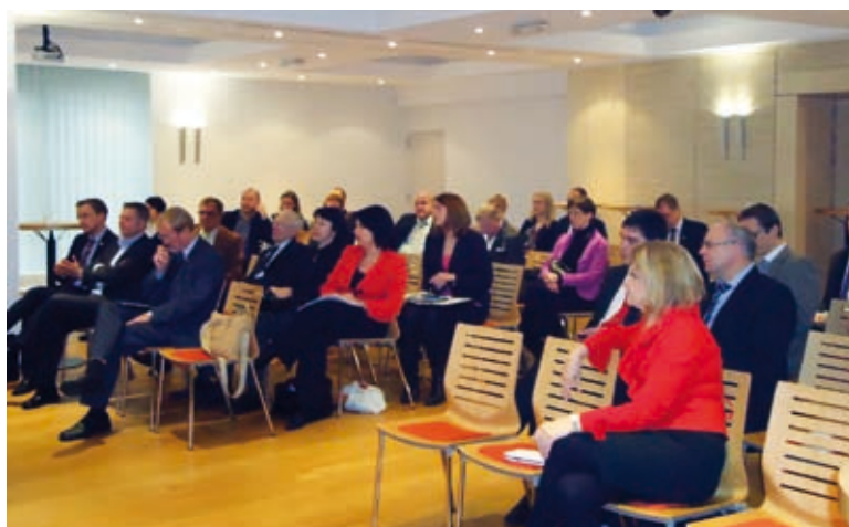
63 rd UBC Executive Board meeting in Brussels, 14 - 15 February 2012