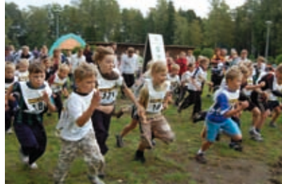
The main topics for both children and their parents are healthy diet, adequate physical activity, and the ability to avoid accidents caused by external factors.

Tallinn City Council approved the Health Development Plan for the Population of Tallinn for 2008-2015, according to which all citizens of Tallinn must have the opportunity to live in a health promoting environment and make healthy choices. Tallinn Health Coalition is tasked with the coordination of the implementation of this plan for the Population. Tallinn is characterized by a well-developed system of social services. In 2009, with the economic crisis deepening, the City Government approved an aid package for the city, focused on alleviating unemployment, benefits and social security, counseling, reducing heating costs, and promoting business. Primary medical care is provided in Tallinn by 260 general practitioners, yet some 8-9% of the citizens are not covered by state health insurance. To provide them with the primary medical care they need, funds are allocated annually from the city budget to pay for their primary medical care appointments. About 650 veterans, who were involved in the clean-up of the Chernobyl disaster, live in the city. They are provided with free of charge dental care, rehabilitation and, if needed, compensation for the cost of glasses. Health behavior begins at an early age, and 126 kindergartens and further on 82 schools focus on this. Obesity is a serious problem among students, with 12% of boys and 9% of girls being overweight.