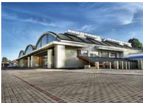
Pomeranian Science and Technology Park in Gdynia.

Pomeranian Science and Technology Park phone: +48 58 735 11 40/41 e-mail: office@ppnt.pl info@ppnt.pl www.ppnt.gdynia.pl