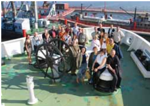
The participants on board of the Ship - the Museum of the Shipyard Industry

More than 20 colleagues from Sweden, Finland, Denmark Latvia, Lithuania, Poland and Germany got together in Rostock on 20 – 23 September 2006. On the basis of examples from Rostock different experiences in handling of waste land were discussed. The guests presented their impressions and proposals how to deal with these problems at the end of the workshop.