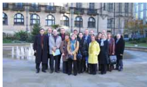
Project partners have met a few times in various cities - here in Sheffield in November 2005

strategies, developing concrete services and applications for different purposes. One of the most exciting activities in the project lately has been starting the preparation of a joint study on European best practices and experiences of eGovernment actions and in related