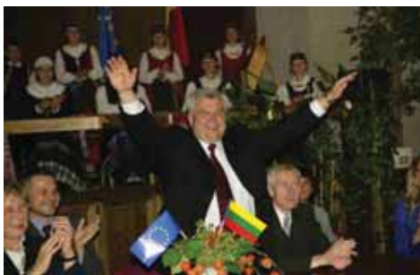
Mayor of Klaipeda Rimantas Taraskevicius on the day of Europe Prize award

Currently, Klaipeda carries out 10 INTERREG projects in the spheres of environment, energy efficiency and water tourism. In 2006, the total direct EU support to the city is