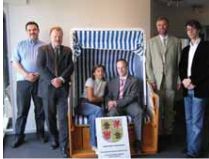
The team of the Information Office in its new premises - the genuine Baltic Sea feeling

decisions are made. The policy-making in Brussels is the European domestic policy. The German Constitution