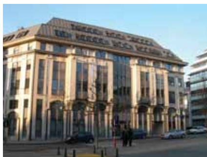
The UBC Antenna Office, hosted by the Stockholm Region, is open