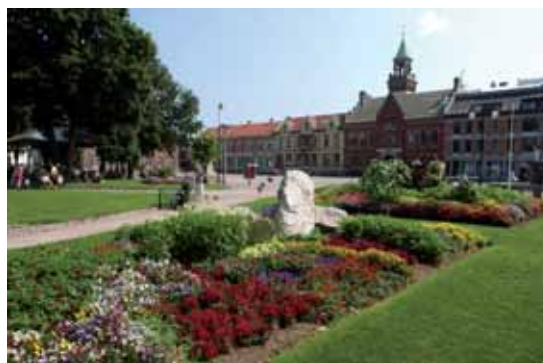
Kristiansand has been represented in Brussel since January 2005

South Norway has interesting research and educational environments that has good knowledge and experience in EU financed projects, and it is a strength to have a regional