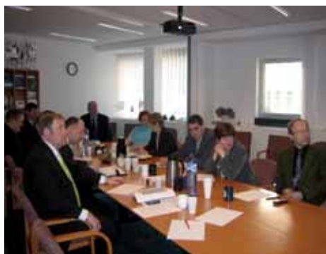
The Brussels Office organises meetings and seminars, offers support in building transnational partnerships and helps with partner search.

The main tasks of the office are to participate in meetings, conferences, seminars, to gather information on current and future policies, legislation and programmes from EU institutions with direct implications for local authorities, to provide Estonian local authorities up to date information on EU