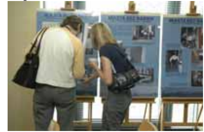
The exhibition "Cities without barriers"

in their countries. In the course of the meeting the experiences of Poland in the field of municipal disability policy were also presented.