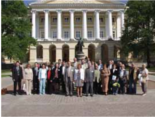
Participants of the 46 th Board meeting

limit of 150 km for maritime border cooperation unchanged, the cross-border cooperation programme for the Southern Baltic Region will be established. The so-