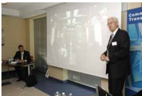
Annual Meeting of the Commission - Integration of the Transport Systems in Baltic Europe took place in Gdynia on 29 September