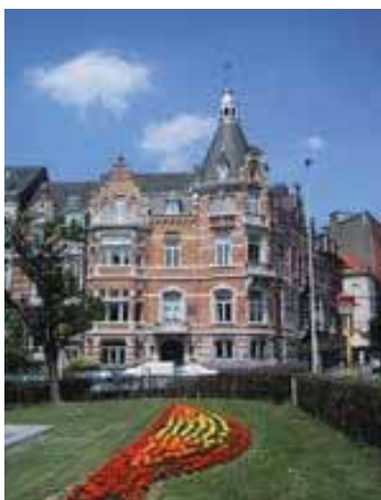
Baltic Sea House in Brussels