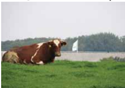
One of the approved Green Network farms

The environmental "Green Network" is a voluntary, regional collaboration working towards sustainability, involving authorities, private companies and farmers. The network has developed a large number of tools for creating an overview of environmental and natural conditions at individual farms, in order to implement environmental control with a view to achieving ongoing improvements, as well as the protection and improvement of the nature in and around the farm. The nature conservation and environmental work at individual farms is described and documented in the 'farming environmental statement report' which is approved individually by the network and involves biannual renewal of the report. The report includes a requirement that the farmer outlines whether the goals for the preceding period have been met.