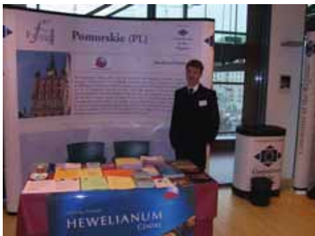
Representation in Brussels provides opportunity to promote the key projects and activities

- Promoting the region - the office disseminates information on investment opportunities and tourist