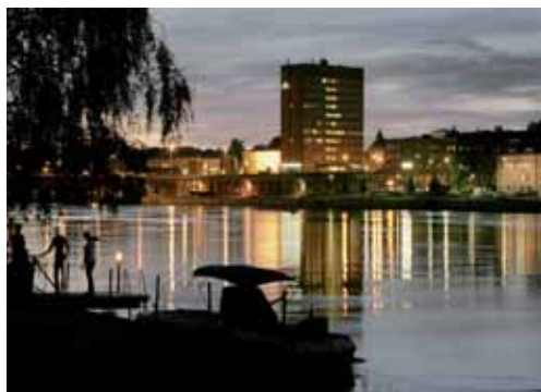
The Ume river at city center of Umeå

Umeå is very interested in having a clear view of what is going on in the European Union, especially when it comes to new directives which will affect our activities and when it means possibilities to get funding for interesting projects. Our main tool for lobbying is the North Sweden European Office which is the joint regional office for the counties of Norrbotten and Västerbotten, the northernmost Swedish regions. The main purpose of the office is to contribute and encourage Northern Sweden to become an active and competent region on the European level. The founding organisations are the municipalities, the county councils, the county administration boards,