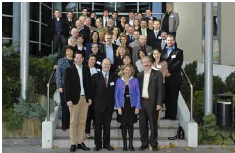
More than 60 participants attended the 47 th UBC Executive Board Meeting in Gdynia, 19-20 October 2006