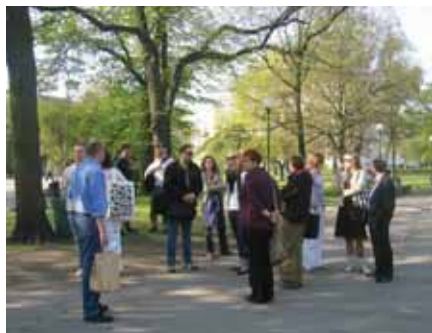
Commission on Youth Issues working group, Tallinn, 12-14 May 2006

was planning the next youth conference, planned to take place in Pärnu in 2007 at the same time as the UBC General Assembly.