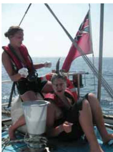
The young sailors on board found some time also for fun