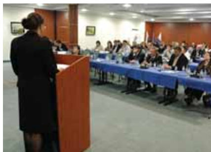
The UBC Executive Board met in Gdynia