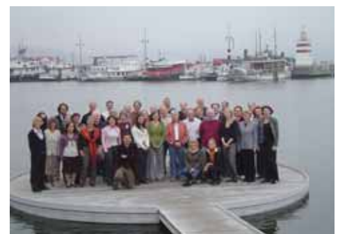
59 environmental experts participated in the MUE-25 training session in Lahti

"In Lahti, we are willing to learn from city networks and gather practical