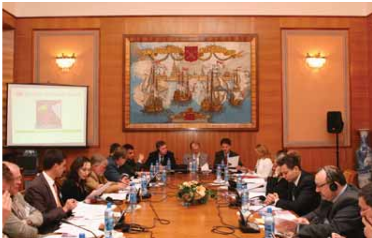
The 46 th UBC Executive Board Meeting, St. Petersburg/Kronstadt, 9-10 June 2006