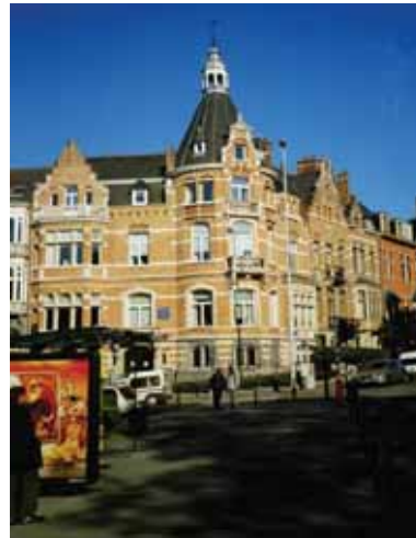
Malmö Office, Palmerston Av. 26

where the urban agenda and problems are being targeted. It has also helped to develop the lobbying and promotion activities run from the Brussels office, involving benchmarking actions with other cities in Europe on topics such as governance, city branding, employment policy etc. Brussels offers an arena of contacts and opportunities but it is important to stay focused on the issues that matter most.