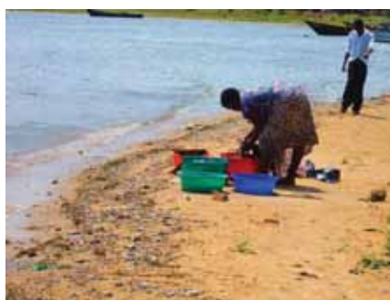
The internship in LVRLAC in Entebbe, Uganda