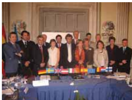
EU Office of Helsinki is a member of the Lisbon Regions Network, here: Political Declaration signing event in Valencia