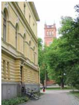
Vaasa will host the next CoC Session