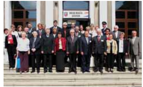
Town-twinning relations are important part of the Szczecin's EU Policy. Here: Mayors and councillors from partner cities during the Sea Days Festival in Szczecin in June 2006.

It is clear that new efforts are necessary to restore the role of the city as a place of social and cultural integration, as