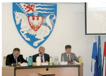
The Board in Koszalin, 4 October 2012, decided the main theme of the UBC General Conference in Mariehamn in 2013 would be how to tackle the problem of unemployment among youth.