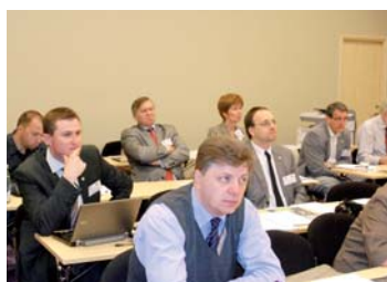
The Board in Rakvere, 24 May 2012, discussed inter alia how to strengthen the UBC presence in Brussels and enhance its lobbying capacity.