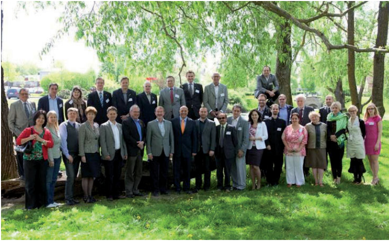
64 th UBC Executive Board meeting in Rakvere, 24 May 2012