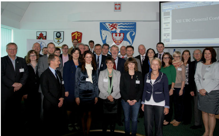
65 th UBC Executive Board meeting in Koszalin, 4 October 2012