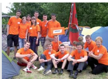
The youth from western Lithuanian municipalities during the summer academy gaining new useful skills.