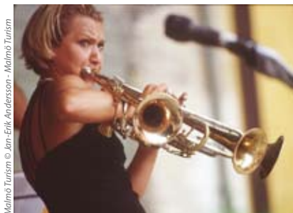
Malmö Tourism © Jan-Erik Andersson - Malmö Tourism